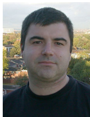
Konstantin Novoselov