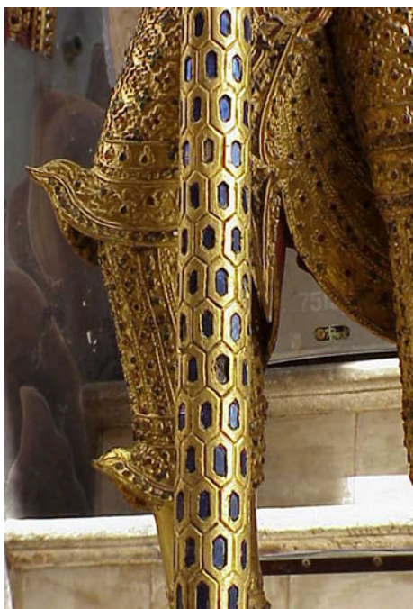
Fig. 2 “Nanotube model” as detail of a decoration at the Royal Palace in Bangkok

The experimental observation of C_{60} was eventually awarded a chemistry Nobel Prize in 1996 to Robert Curl, Harold Kroto, and Richard Smalley. Two physicists pioneered the production of C_{60} , Donald Huffman and Wolfgang Krätschmer, and they might have been recognized by a similar distinction, but they were not. Graphene could be considered at least in principle to be the initial material of all carbon nanotubes and fullerenes. The nanotubes are represented here by a detail of the decorations of the Bangkok Royal Palace (Fig. 2) and the fullerenes by a