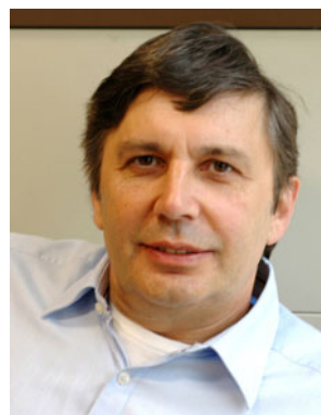
Andre Geim

The Nobel Prize in Physics in 2010 was among those rather rare cases when the Nobel recognition followed relatively quickly the discovery. Geim and his co-authors