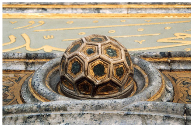
Fig. 4 “Buckminsterfullerene model” as an entrance decoration at Topkapi Sarayi in Istanbul